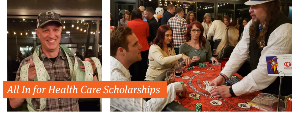
All In for Health Care Scholarships