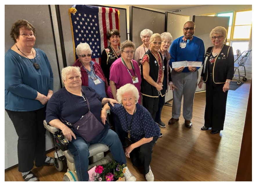
Fraternal Order of Eagles Ladies Auxiliary Aerie 2081