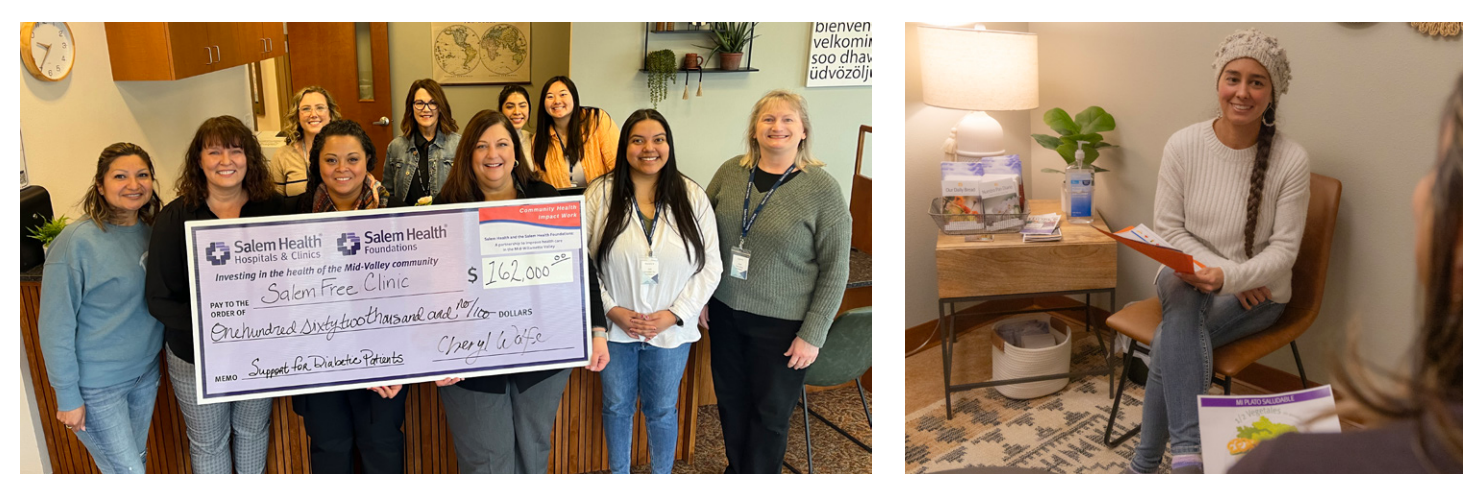
For the past 12 years, we have enjoyed a strong partnership with Salem Free Clinics. That partnership was enriched in 2023 with a Community Health Impact investment of $162,000. Together we have made significant investments in improving the health of people in Marion and Polk counties.

Salem Free Clinics (SFC), who also operates Polk Community Free Clinic in Monmouth and Salem Free Counseling Clinic in Salem, reaches uninsured or under-insured people in our community, most of whom are employed but low-income. Many earn just enough to be ineligible for public assistance, yet not enough to purchase health insurance. Salem Free Clinics is committed to providing culturally competent care including bilingual services and medical interpretation. In 2023, SFC served patients in 15 different languages. Together, Salem Health and Salem Free Clinic screen individuals for diabetes, high blood pressure and high cholesterol and provide follow up care to those who do not have a primary care provider.