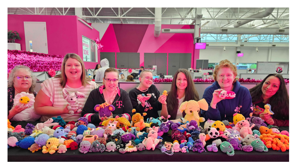
T-Mobile volunteer crocheters

"I am so overwhelmed by the kindness of the gift from the Salem Health Foundation. Because of you, a huge amount of stress has been taken off for the end of the month."