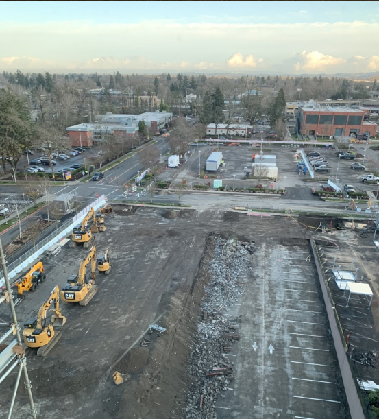
Demolition of the ED parking lot.