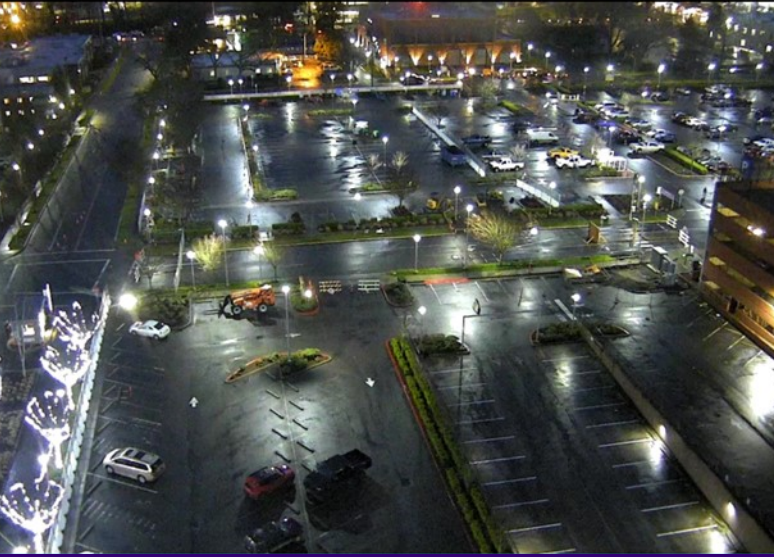
Building A and the emergency department parking lot in early January 2020.