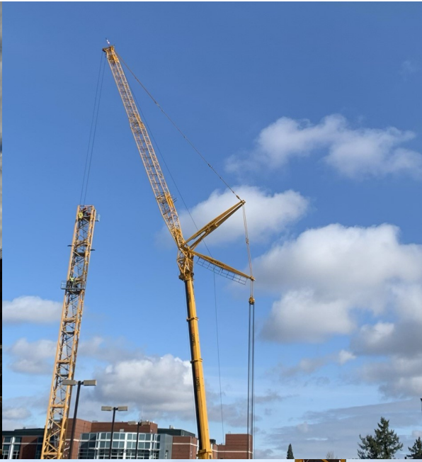
Construction of the tower crane in March.