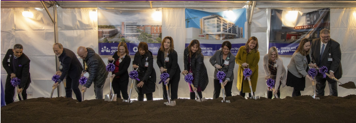
Executive leadership team members at the ground breaking ceremony.