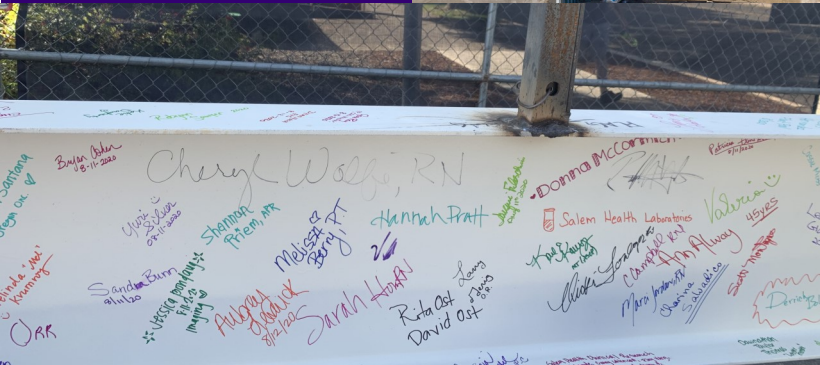
Salem Health staff and providers signed the final steel beam before its placement in the Aug. 13 topping ceremony.