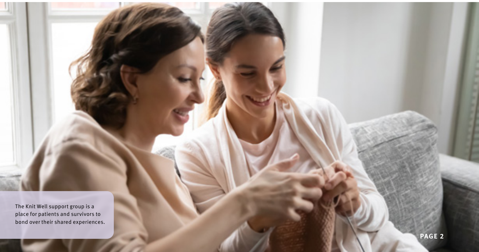
The Knit Well support group is a place for patients and survivors to bond over their shared experiences.

Thanks to their donations — totaling $11,500 in 2024 — we can support cancer patients with free or discounted medication, rides to treatment, chemo care bags and recovery camisoles. Their support also helps us offer free cancer screenings in the community.